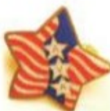
AVA Star — $3