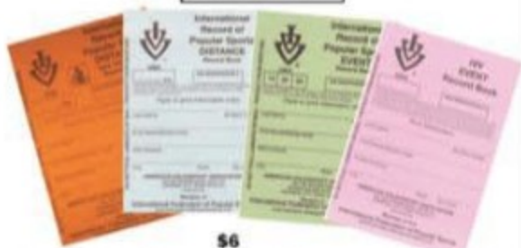
Bike Distance Book brown