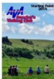
2018 Starting Point $27 + Shipping

Note: If only one to four event or distance books are purchased, shipping is $1.50.