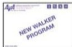
New Walker Packet — $5 (one each of first event and distance books, plus coupons)