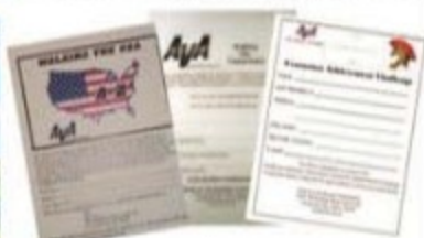
Books, 50 State/51 Capitals — $5 Books, A to Z Walking America — $8 Books, Centurion Achievement Challenge Program — $25 (members only)